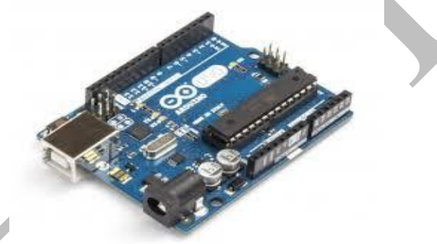
Fig 2: Arduino Uno Board

We will be using Arduino uno board which is a microcontroller board based on atmega328p. It has 14 digital input/output pins (of which 6 can be used as PWM outputs), 6 analog inputs, a 16 MHz crystal oscillator, a USB connection, a power jack, an ICSP header, and a reset button. It contains everything needed to support the microcontroller; simply connect it to a computer with a USB cable or power it with an AC-to-DC adapter or battery to get started. The board operates on 5v power. The board provides effortless interfacing of I/O pins to a variety of other circuits. Arduino platform provides an integrated development environment (IDE) based on the Processing project, which includes support for C and C++ programming languages.