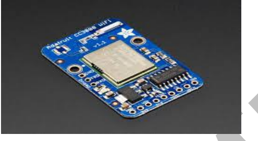
Fig 3: Adafruit CC3000 Wi-Fi Board

For Wi-Fi module we are using TI designed CC3000. The Texas Instrument module is a self-sustained wireless network processor that simplifies the application of internet connectivity. The key benefit of using this module is it minimizes the software requirement of the host micro-controller. It is a low cost low power solution. It comes integrated with a 802.11b/g radio, modem, MAC supporting WLAN correspondence as a BSS station with CCK and OFDM rates from 1 to 54 Mbps in the 2.4-GHz ISM band. It supports all Wi-Fi security modes for individual systems: WEP, WPA, and WPA2. Smart Config<sup>™</sup> WLAN provisioning tools permit clients to connect a headless gadget to a WLAN system utilizing a cell, tablet, or PC. Integrated IPv4 TCP/IP stack with BSD attachment APIs enables straightforward web integration with any microcontroller, microchip, or ASIC. Simple APIs enable easy integration with any single-threaded or multi-threaded application. It can work on single pre regulated power supply or can be directly connected to a battery.